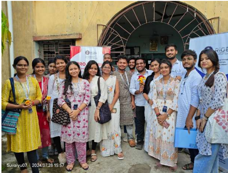
PROJECT RH TEAM (BLOOD DONATION DRIVE)