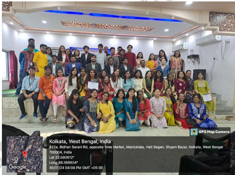
INTERNSHIP COMMENCEMENT DAY